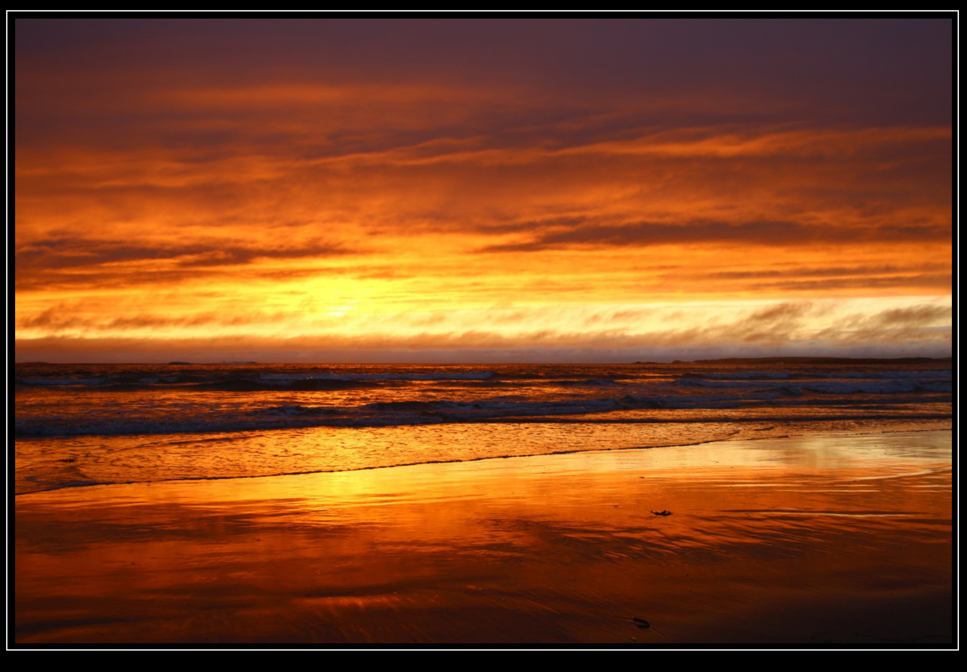
oldsymbol{\circ} Have a pause at the end of the day and be grateful for the color games, it has offered you. oldsymbol{\odot}