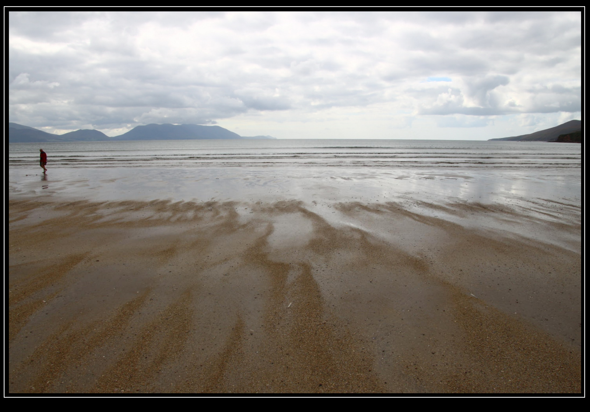
There is always a path, even if it's not immediately apparent. Find the one which is yours. At one of the first bays of Dingle Peninsula people enjoy their meditative barefoot walk at the endless beach during any kind of weather – Sept. 2018