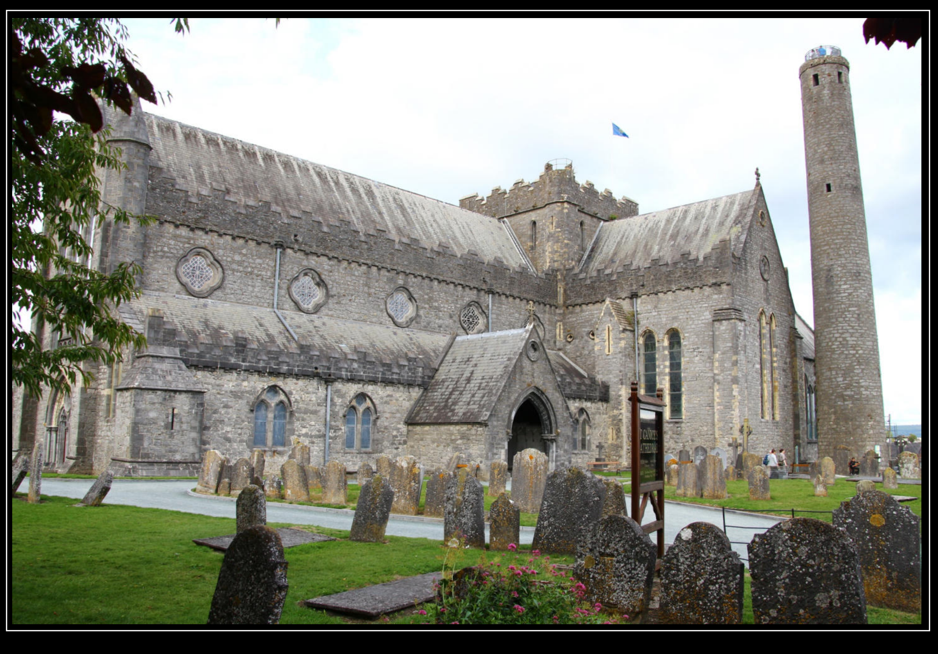
● Be alive and happy as long as it is possible. The limitation of life is certain for all of us. ©

Bonus-Pic: "Traditional" cementries, cathedrales and castles like here in Kilkenny shape the impage of a place just as the music in the pubs – August 2018