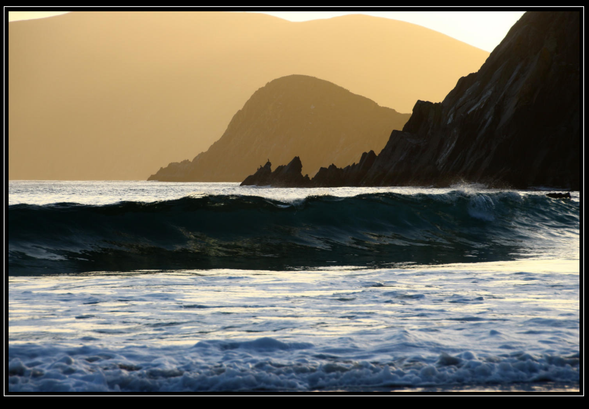
Spring into the waves of life with full energy and let carry you along by their natural rhythm. I enjoyed the evening atmosphere at the beach of Slea Head all by myself and shared the view to Blasket Islands only with seagulls and seals – Sept. 2018