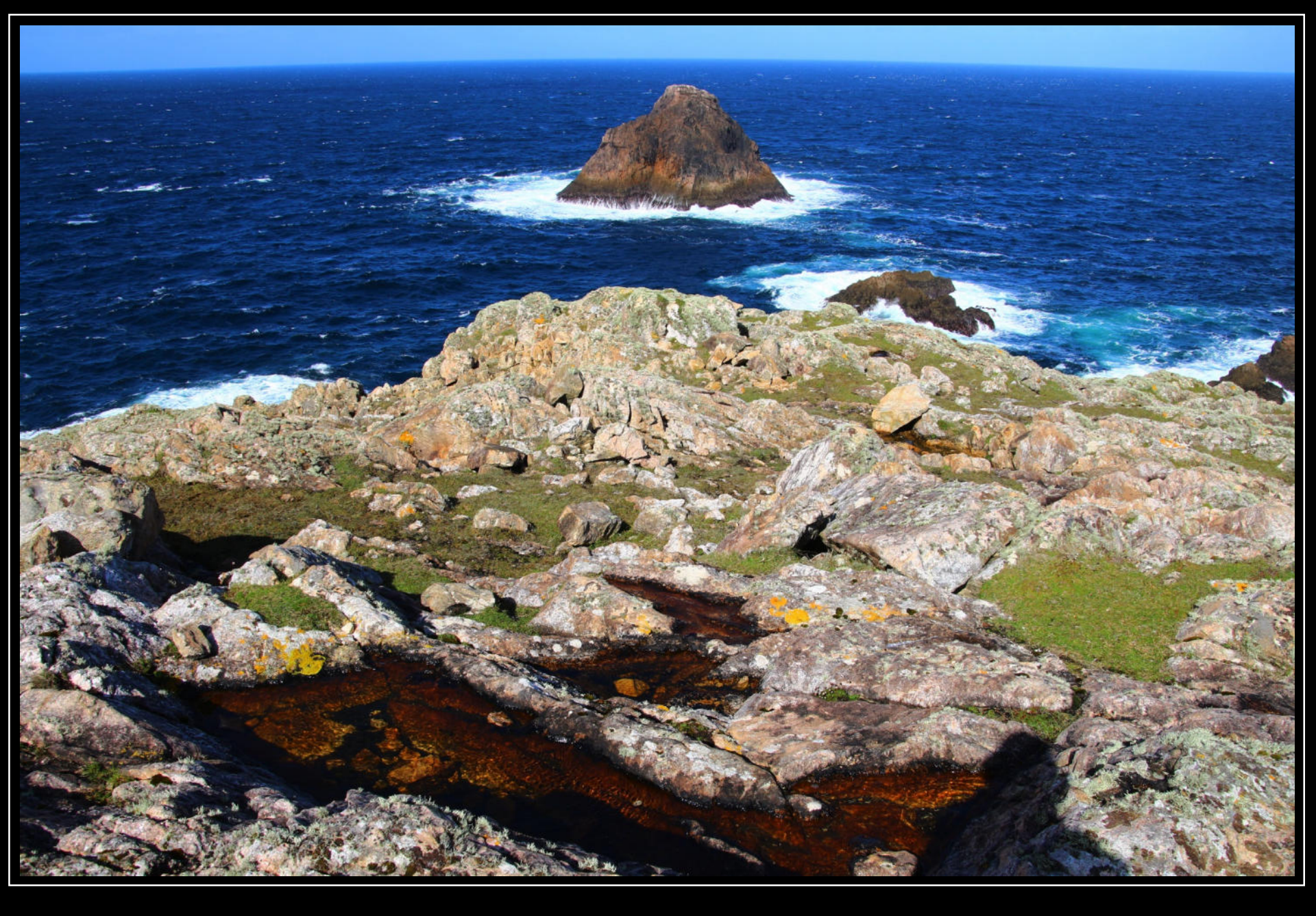
Achieve also the goals, which seem to be unattainable for you, by using your yearning and willpower. ☺