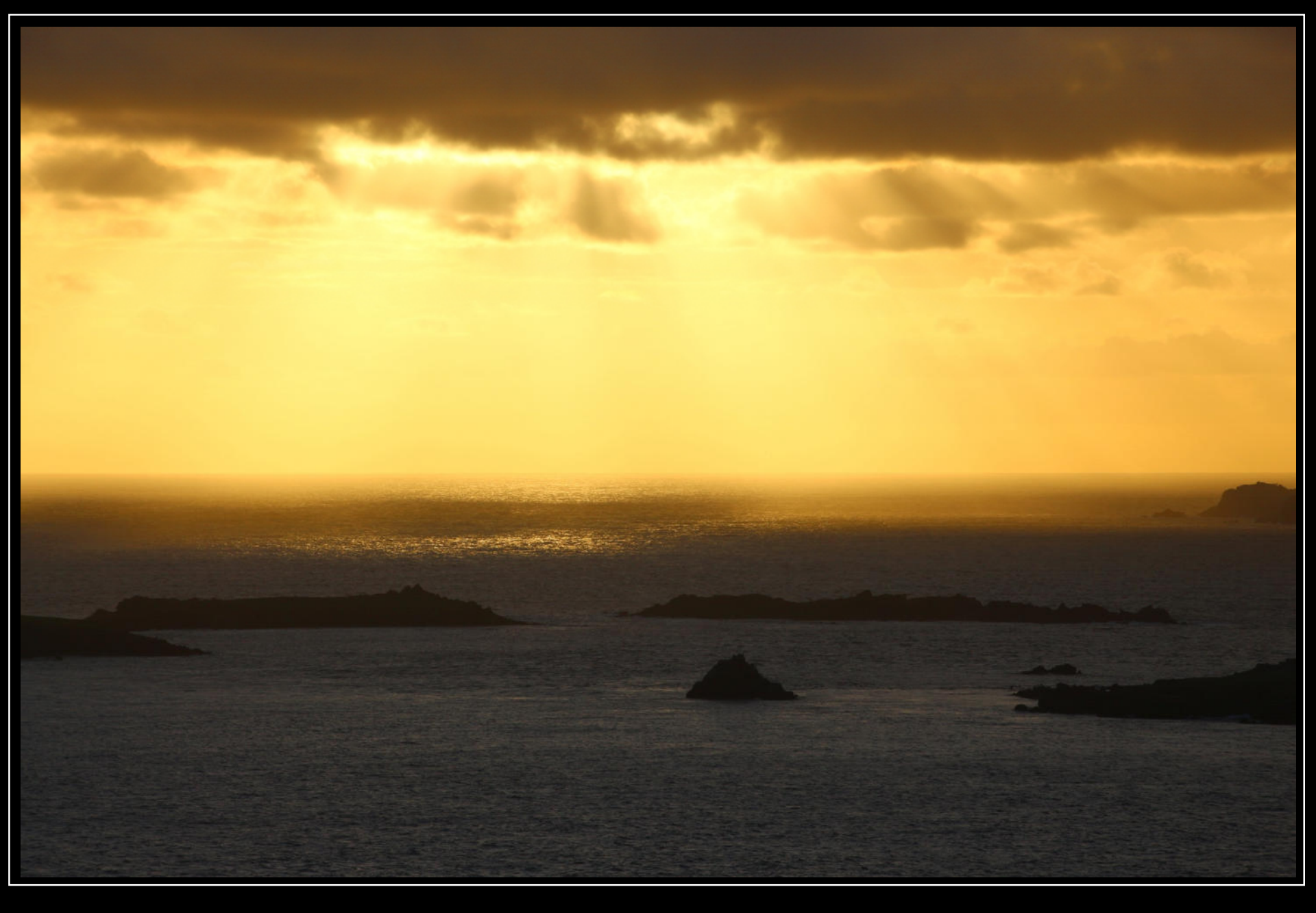
Every darkness, every shadow passes by. Be your own light. ☺