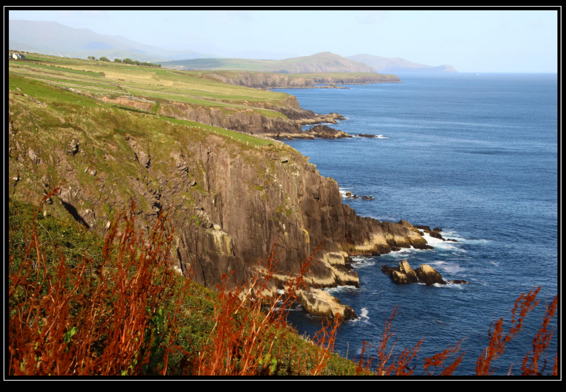
Welcome on the green island, where the music of untameable natures brews its own unique Guinness. ☺