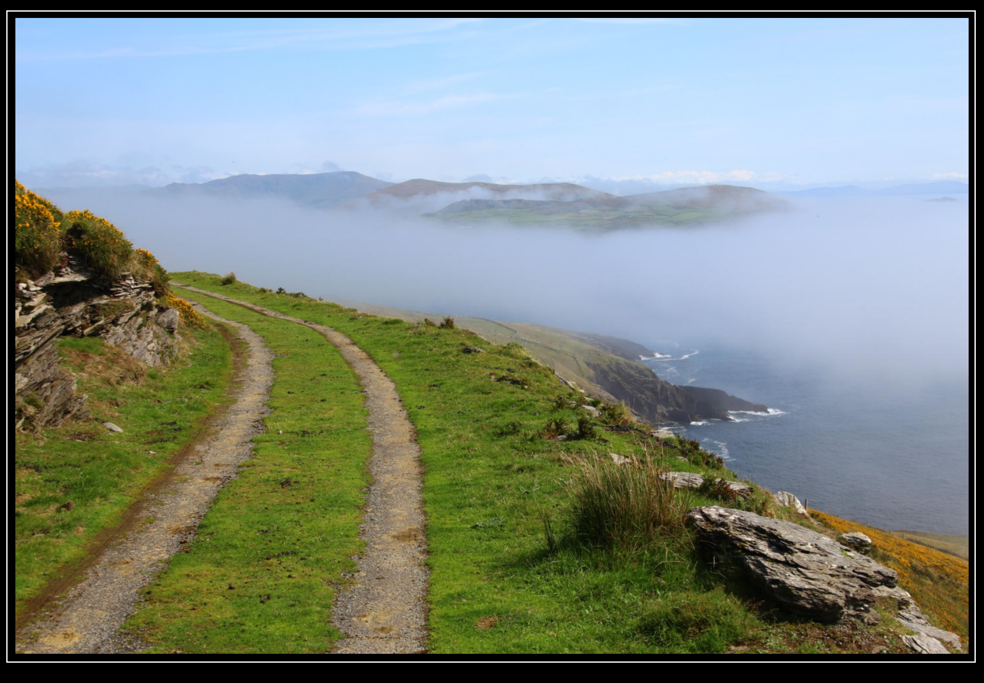
Trust your intuition: it guides you, when the view on things fogs up. ©

The most Western point of Beara Peninsula is Dursey Island. Only 2 people are living here. It is only accessible with a very old gondola – Sept. 2018