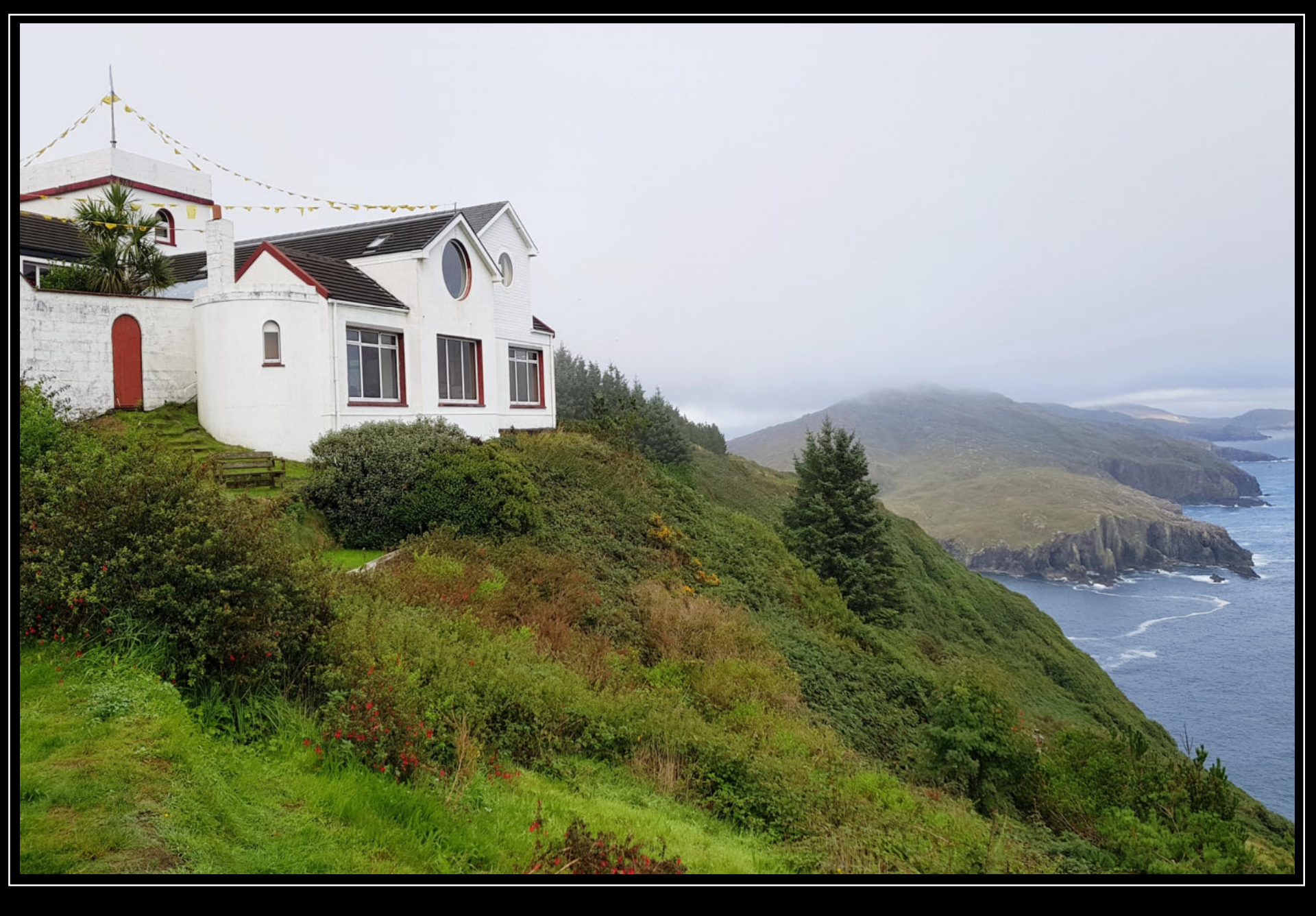
oldsymbol{\circ} Look into the distance of the world and at the same time into the depth of your soul. oldsymbol{\odot}

The meditation monastery of Dzogchen Beara is a spiritual oasis of silence and encounters, embedded in a landscape paradise – August 2018