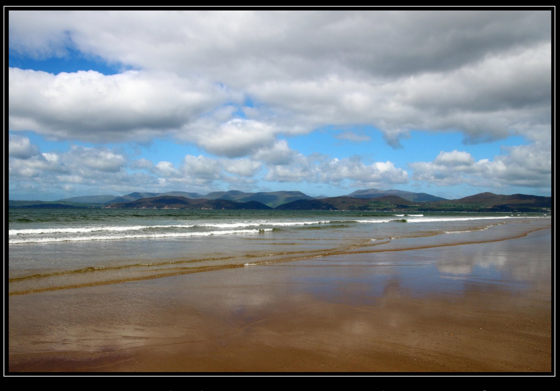
Free the layers of your fears and enjoy, how the universe reflects in your heart. © At the beach of Glenbeigh (Ring of Kerry) the invitation is: feel the harmonic game of sand and sea on your feet for hours – Sept. 2018